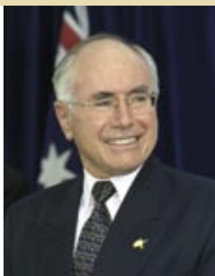
Prime Minister of Australia, The Hon John Howard MP

The Mission of the Australian-American Fulbright Commission is to further mutual understanding between the peoples of Australia and the United States through educational and cultural exchange. This is primarily achieved through the administration of Fulbright Awards to support research and study of Australians in the United States and Americans in Australia each year.